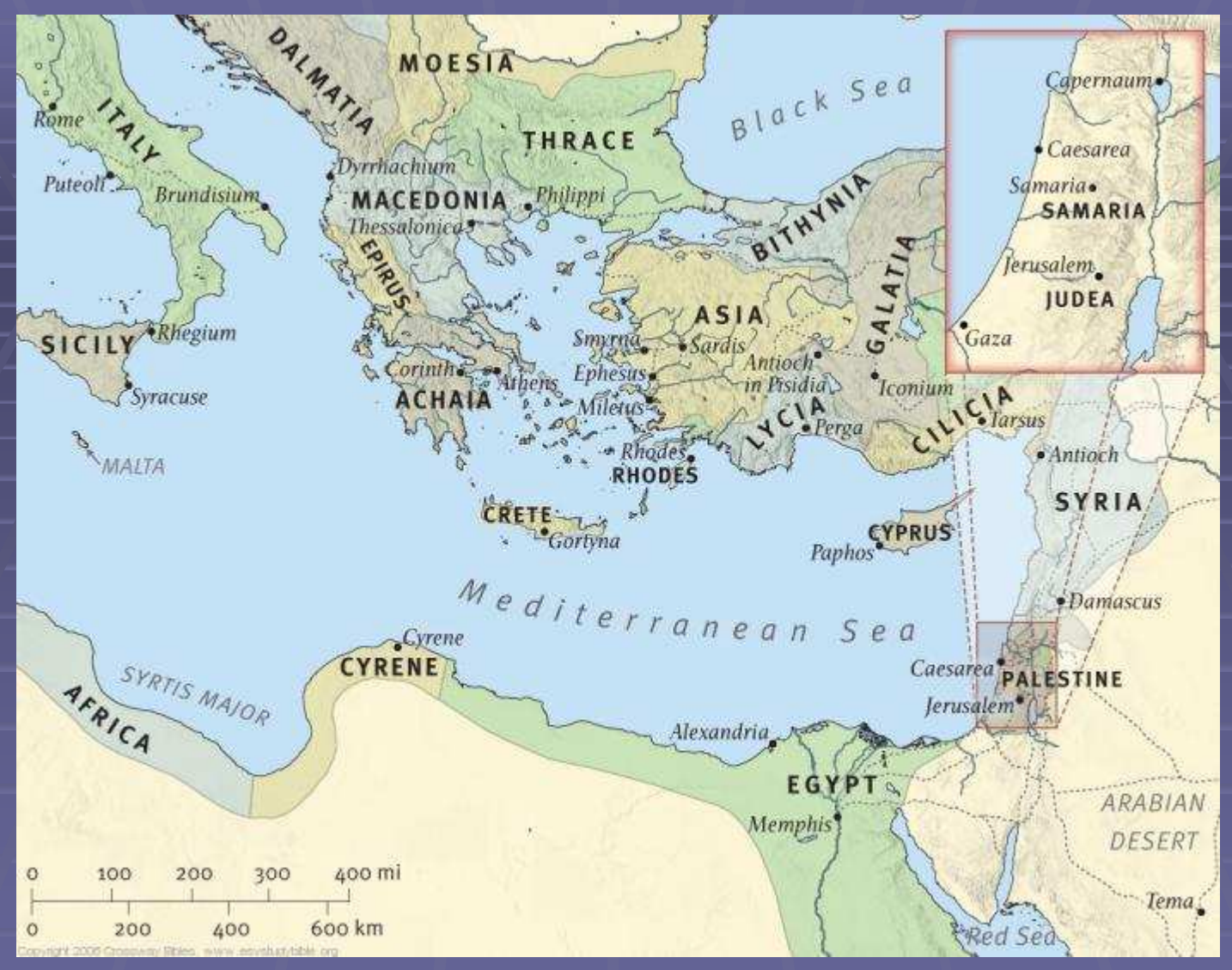
Men of Cyprus and Cyrene Cyrene was a province and city of Libya in Africa