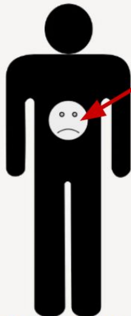
In Adam - all die