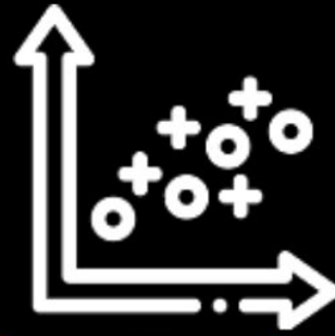
Scattering of the people